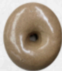
Canela Glaze Rich and creamy cinnamon glaze