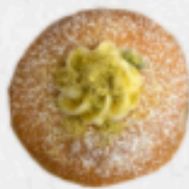
Cannoli Cream With Pistachio