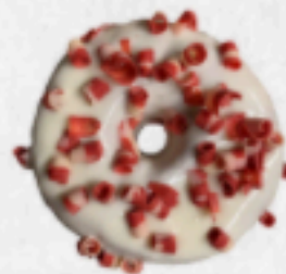
White Chocolate Peppermint