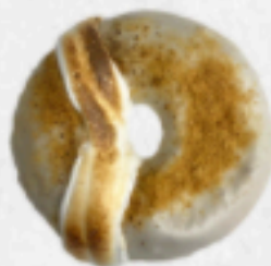
Key Lime Key Lime Pie glazed fluffy doughnut topped with toasted marshmallow and graham cracker crumbs